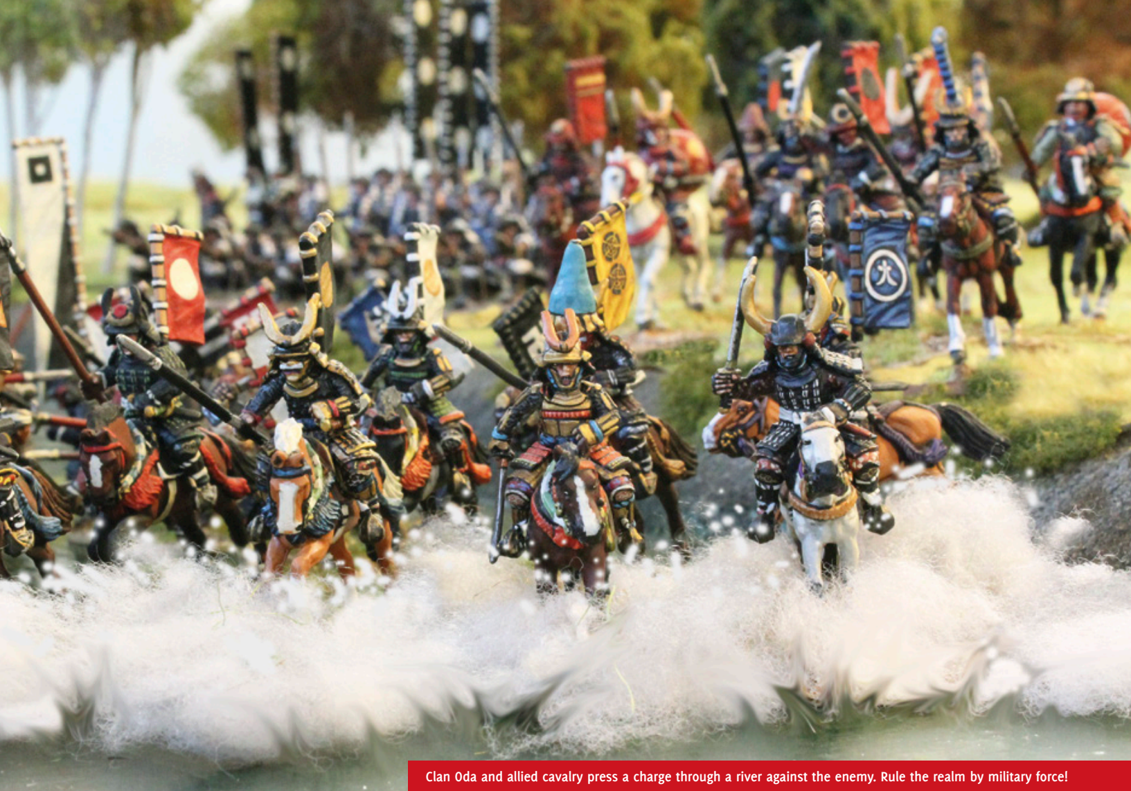
Clan Oda and allied cavalry press a charge through a river against the enemy. Rule the realm by military force!

Tokugawa-shitennō (excellent general). First line (closest to the river) of the left wing (at 1)