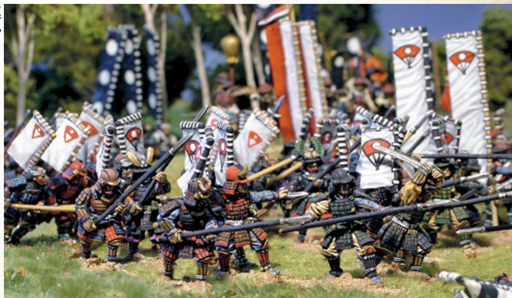
Samurai allied to Clan Tokugawa advance to meet the Asakura. They bear an ohgi-mon (a fan shaped mon).