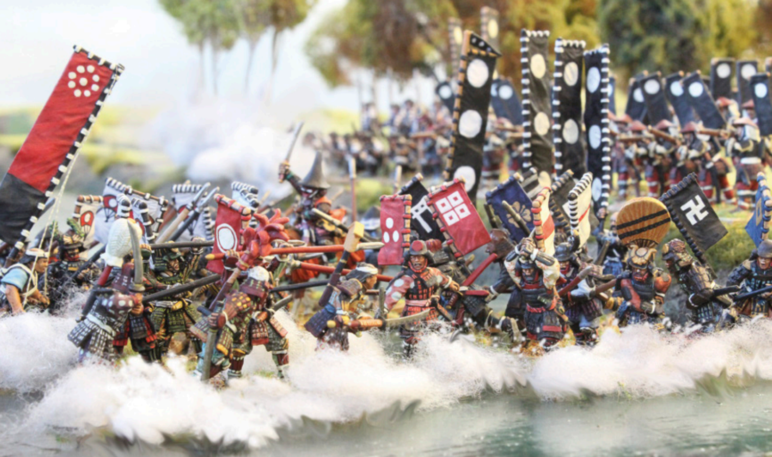
Samurai allied to Oda and Asai clash for the ford. Note the individual mon symbols and the Buddhist manji symbol.

however, it is deeper in the front opposite Nobunaga. To the west of the bridge it will take a unit two turns to cross the river, but to the east it will take three turns. Firearm units cannot fire for three full turns after they exit the river, and archers cannot fire on the turn after exiting the river.