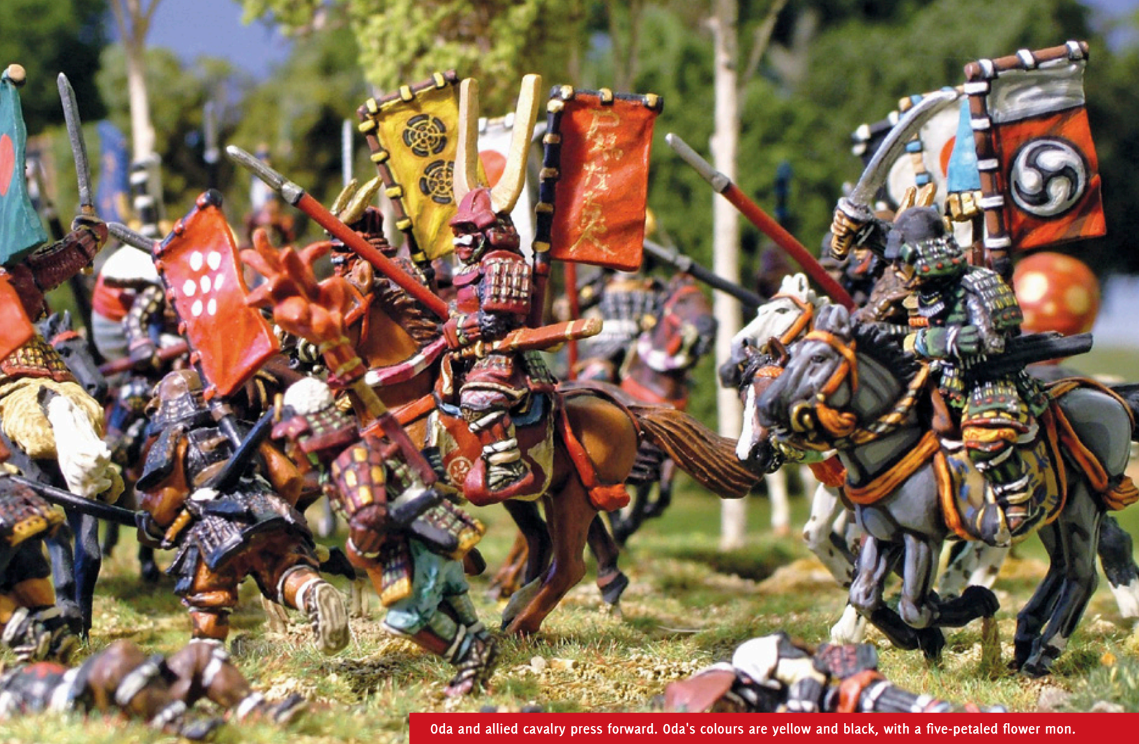
Oda and allied cavalry press forward. Oda's colours are yellow and black, with a five-petaled flower mon.

to delay his advance in order to protect his lines. As their combined forces joined together, they were bolstered by the addition of Ikkō-ikki forces who saw the opportunity to deliver a blow to one of their longstanding foes.